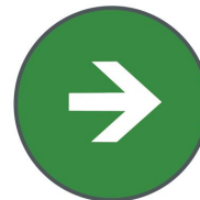
4 legends, up, down, left & right