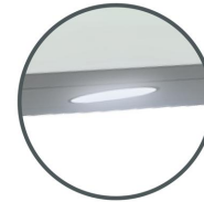
Task Light Emergency